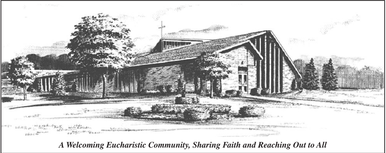
A Welcoming Eucharistic Community, Sharing Faith and Reaching Out to All

511 CHEAPSIDE ST., LONDON, ONTARIO N5Y 3X5 PHONE 519-433-6689 FAX 519-433-2301 E-MAIL: stmichlon@dol.ca www.stmichaels.dioceseoflondon.ca